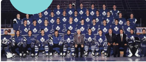
Toronto Maple Leafs 1995-1996